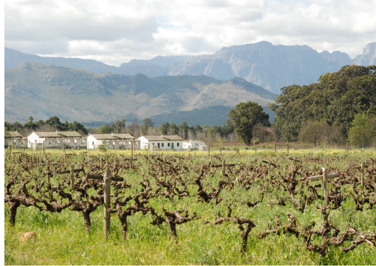
Farm cottages on Boschendal Estate

Commerce-related projects focus on tourist accommodation in clusters of vacant and derelict farm workers cottages; and improving the efficiency of farm operations by creating a farm management hub.